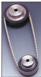
SINGLE SIDED BELT

STD : Polychloroprene/Rubber Belt Body, Glass Fibre Tension Members